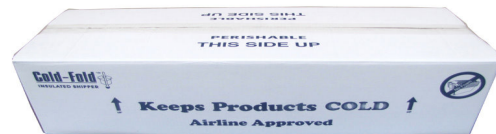
6> Tape top of box - your done!