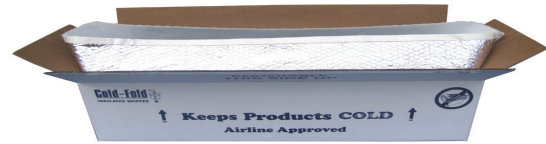
2> tape bottom of Box