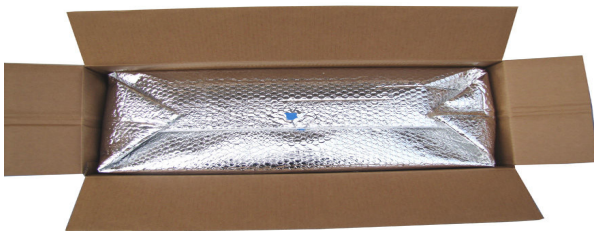
5> Fold in outer foil corners