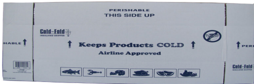
1> Open Box