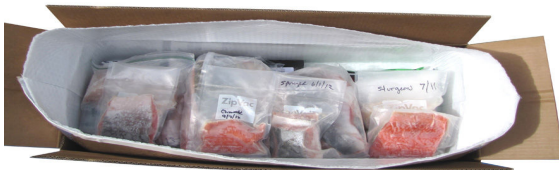
3> Place your product inside the foil bag